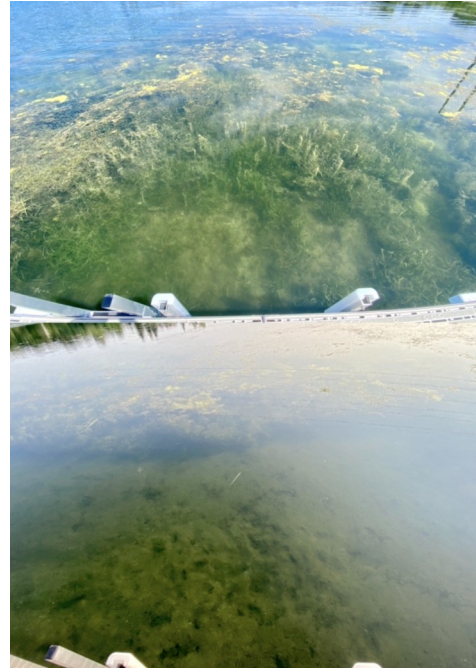
Top: After EWM removal. Bottom: Before removal

The MFA has been in contact with a few options that you might consider to be proactive in protecting our lake. One option is to support diver efforts to remove invasive milfoil. Unlike mechanical harvesting, hand-pulling weeds by their roots provides instant, highly effective treatment and prevention of unwanted lake weeds. Some of this includes the use of SCUBA divers.