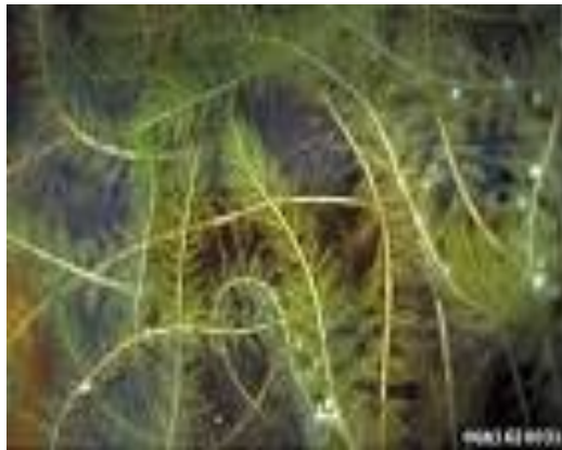
Eurasian Water Milfoil

With no grant funds available, the MFA is having to significantly curtail this year's plans to control the expansion of EWM on the flowage. If funding is available, at a minimum, new EWM bed mapping surveys will be conducted to monitor the expansion of